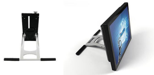
Desktop folding bracket for sale