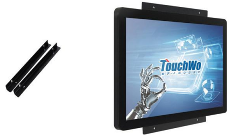
Embedded bracket optional