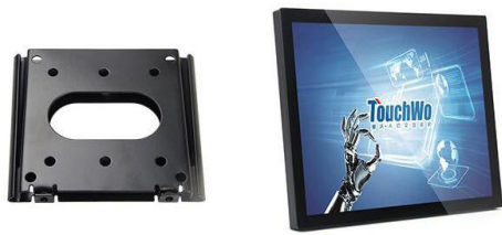
Wall mount bracket