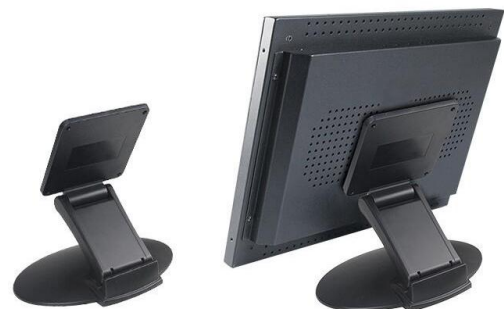
Desktop folding bracket for sale