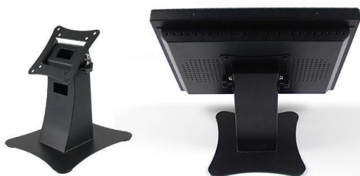
Desktop base for sale