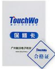
Warranty card Certificate